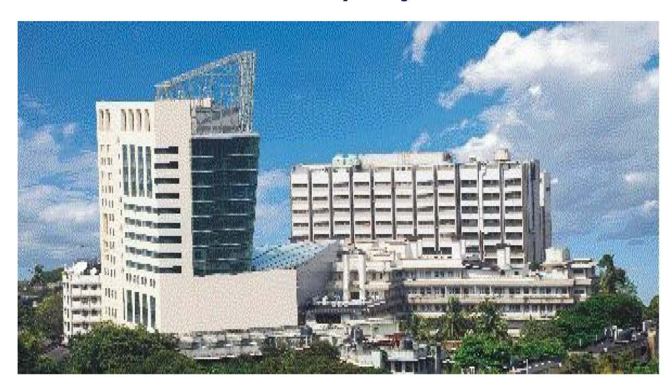
Department of Preventive Oncology Tata Memorial Centre Mumbai, India.