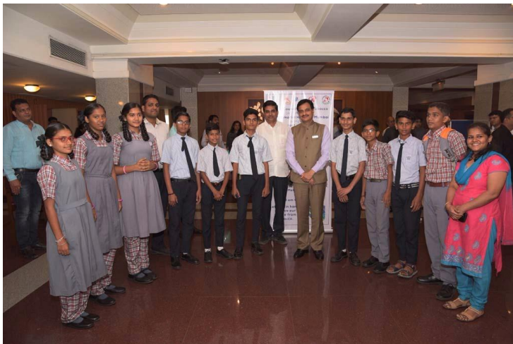
Minister of State (Home) Sh. Ranjit Patil with School Children who participated in the event